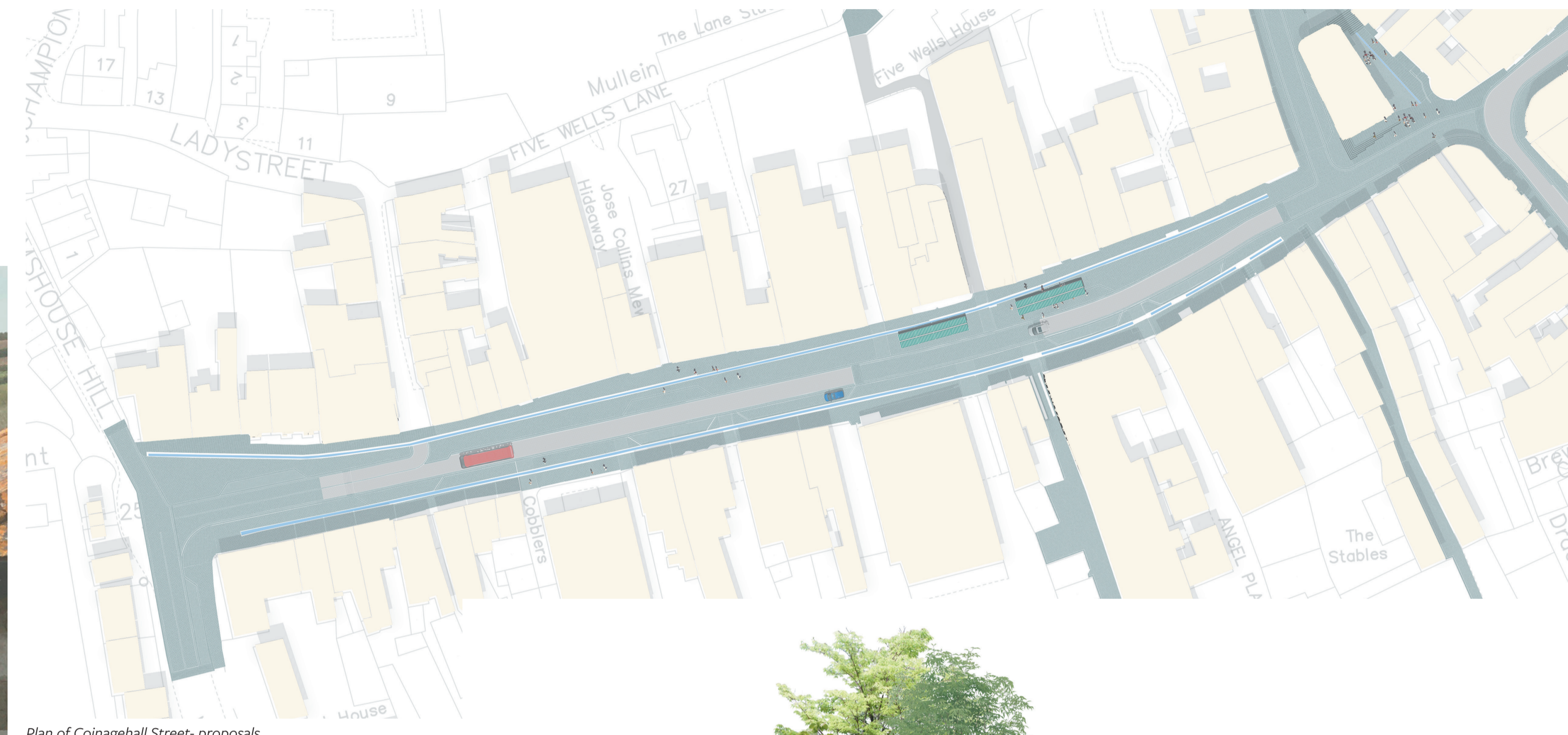
Plan of Coinagehall Street - proposals