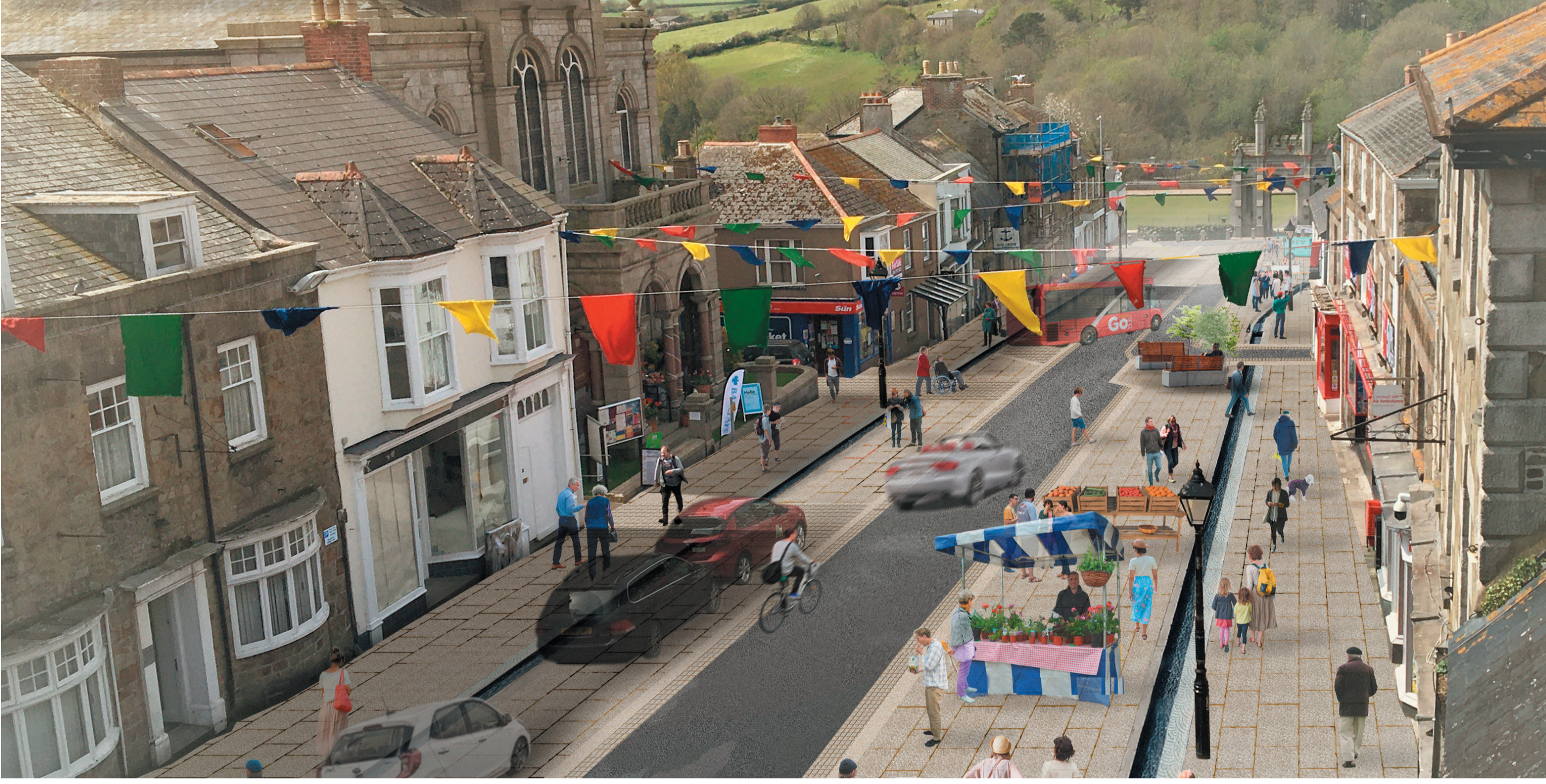
Before and after - looking down Coinagehall Street. Artist's impression showing proposed new Public Realm space.