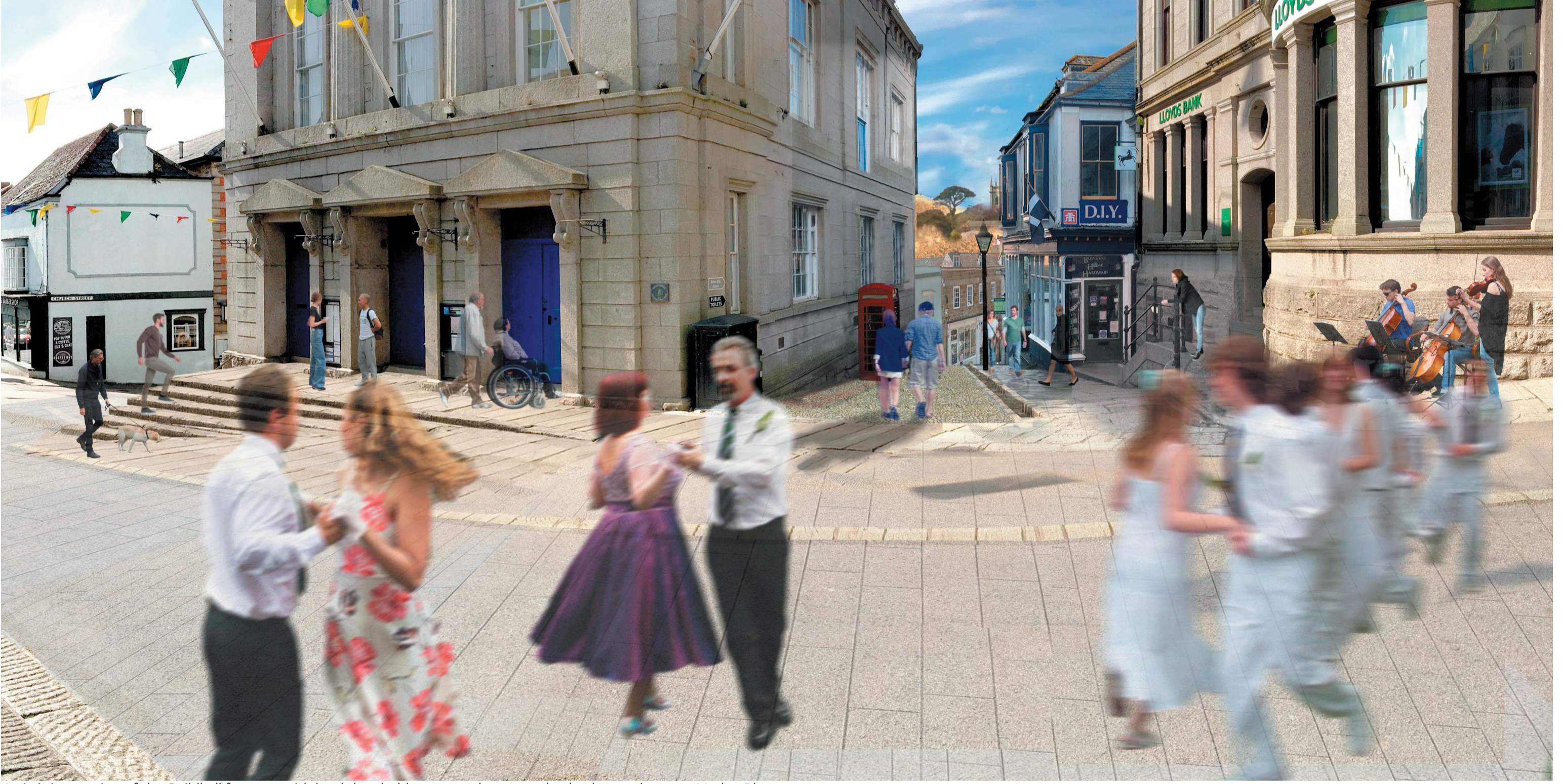
Artist's impression of the Guildhall frontage with level threshold access and steps, and a de-cluttered area to Market Place.