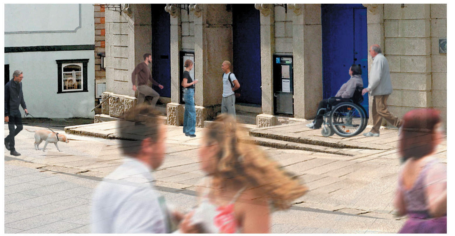
The Guildhall frontage with level threshold access to right-hand door only.