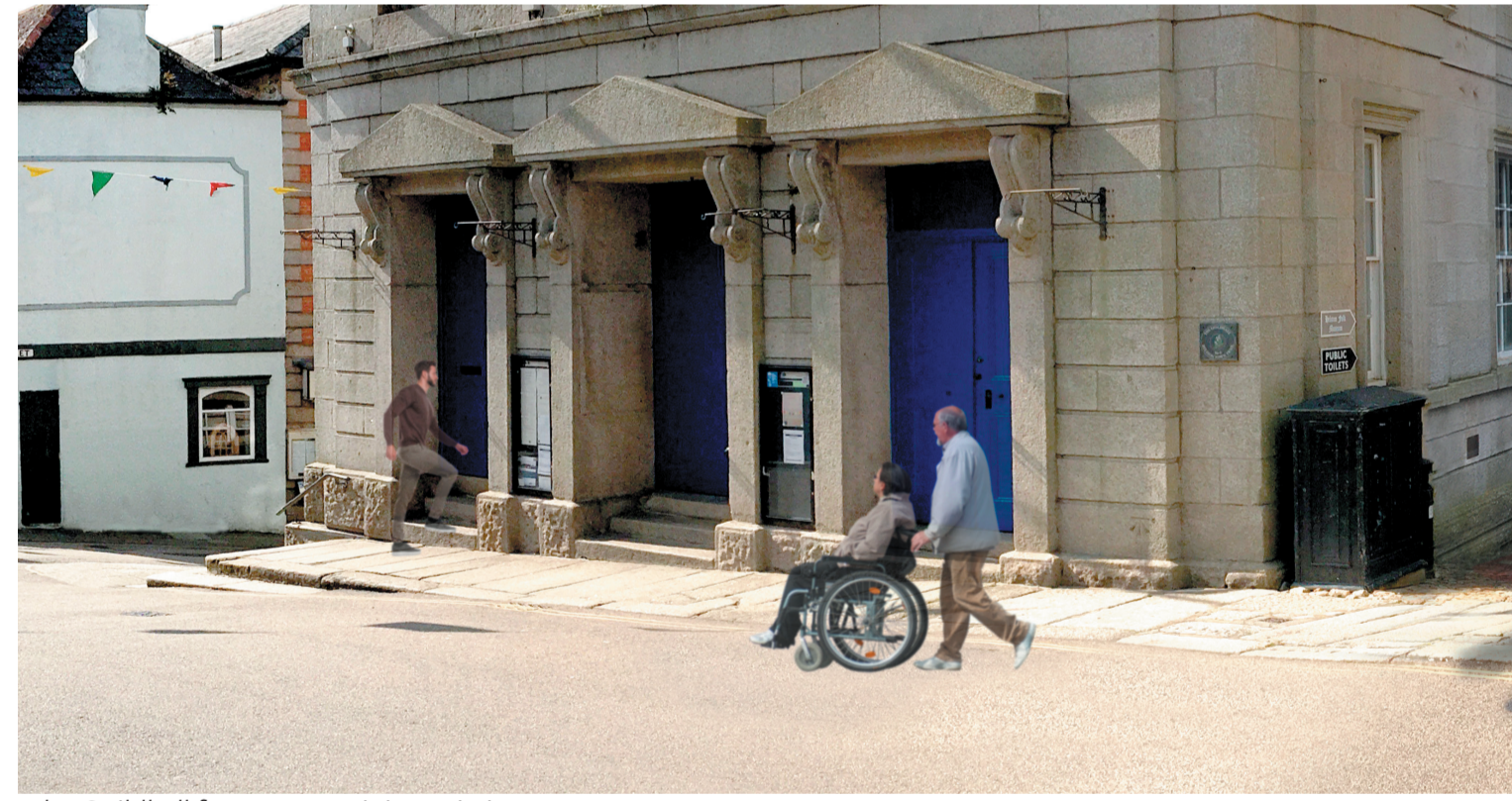
The Guildhall frontage retaining existing steps.