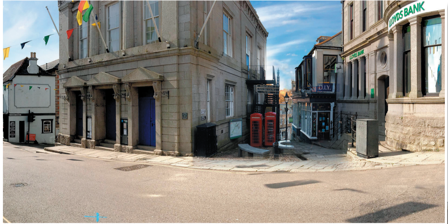
The Guildhall and Market Place existing.

Making the Guildhall and Cultural Quarter the civic heart of Helston.