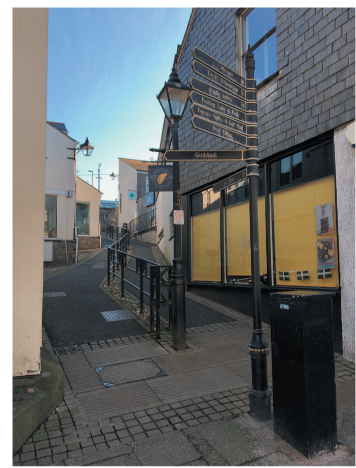
View looking up Horse and Jockey Lane- existing and proposed