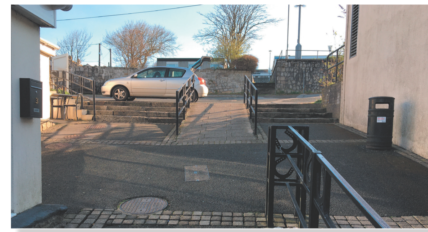
View of the top of Horse and Jockey Lane - existing