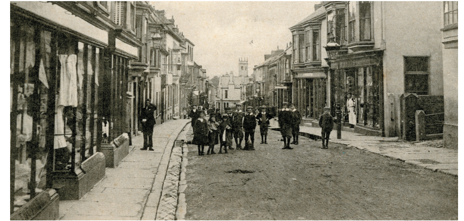
View looking along Meneage Street at the bottom of Horse and Jockey Lane c. early 1900's. A granite gate post can be seen to the bottom of Horse and Jockey Lane to the right of the image.