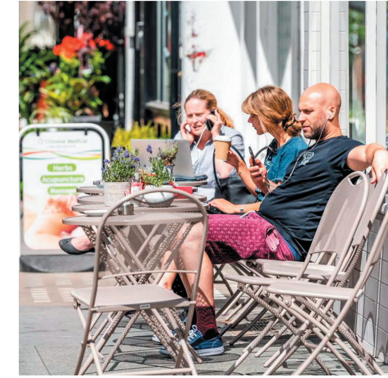
Creating space for traders and seating