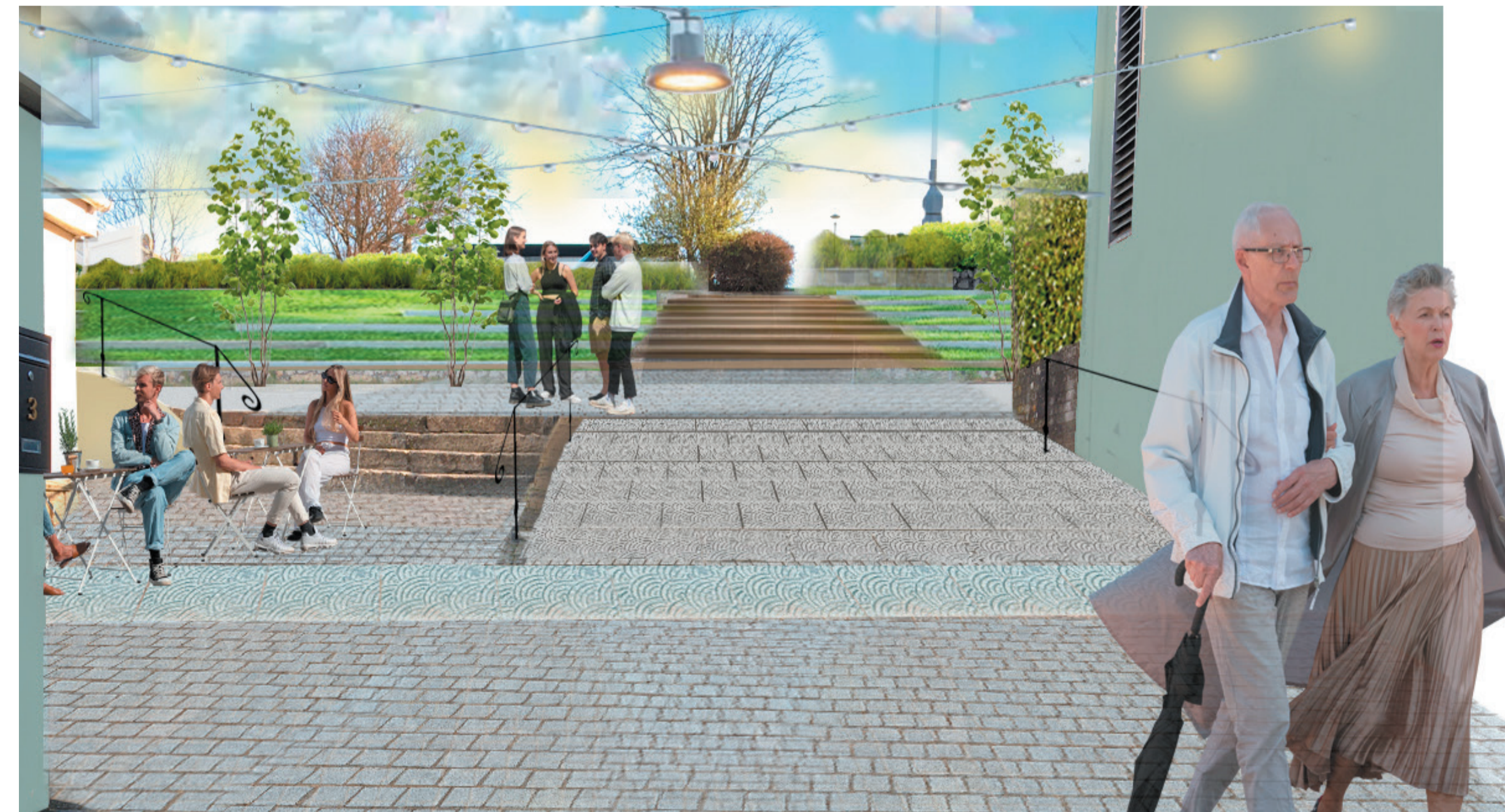
Artist's visualisation of the top of Horse and Jockey Lane

A repainting scheme for Horse and Jockey Lane is also proposed: Dulux Heritage colours have been chosen for a classic and contemporary scheme, using blues, greens and reds which reference Helston's emblem and symbols, in warmer and earthier tones with hints of warm grey added to balance the stone of Helston's streets. Darker tones add drama, with lighter tones to contrast and highlight architectural features.