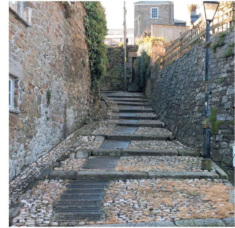
Materials to reference the historic opes. View of Wheelbarrow Lane.