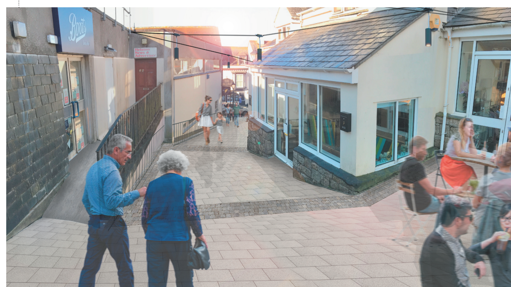
Artist's visualisation looking down Horse and Jockey Lane