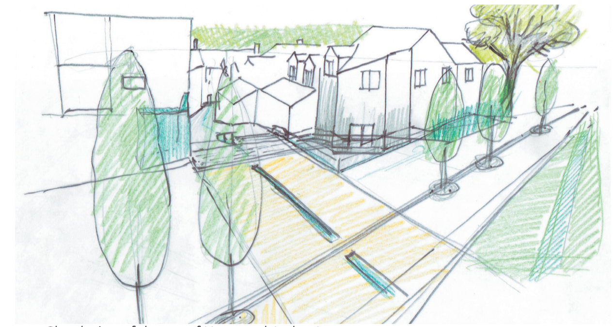
Sketch view of the top of Horse and Jockey Lane.