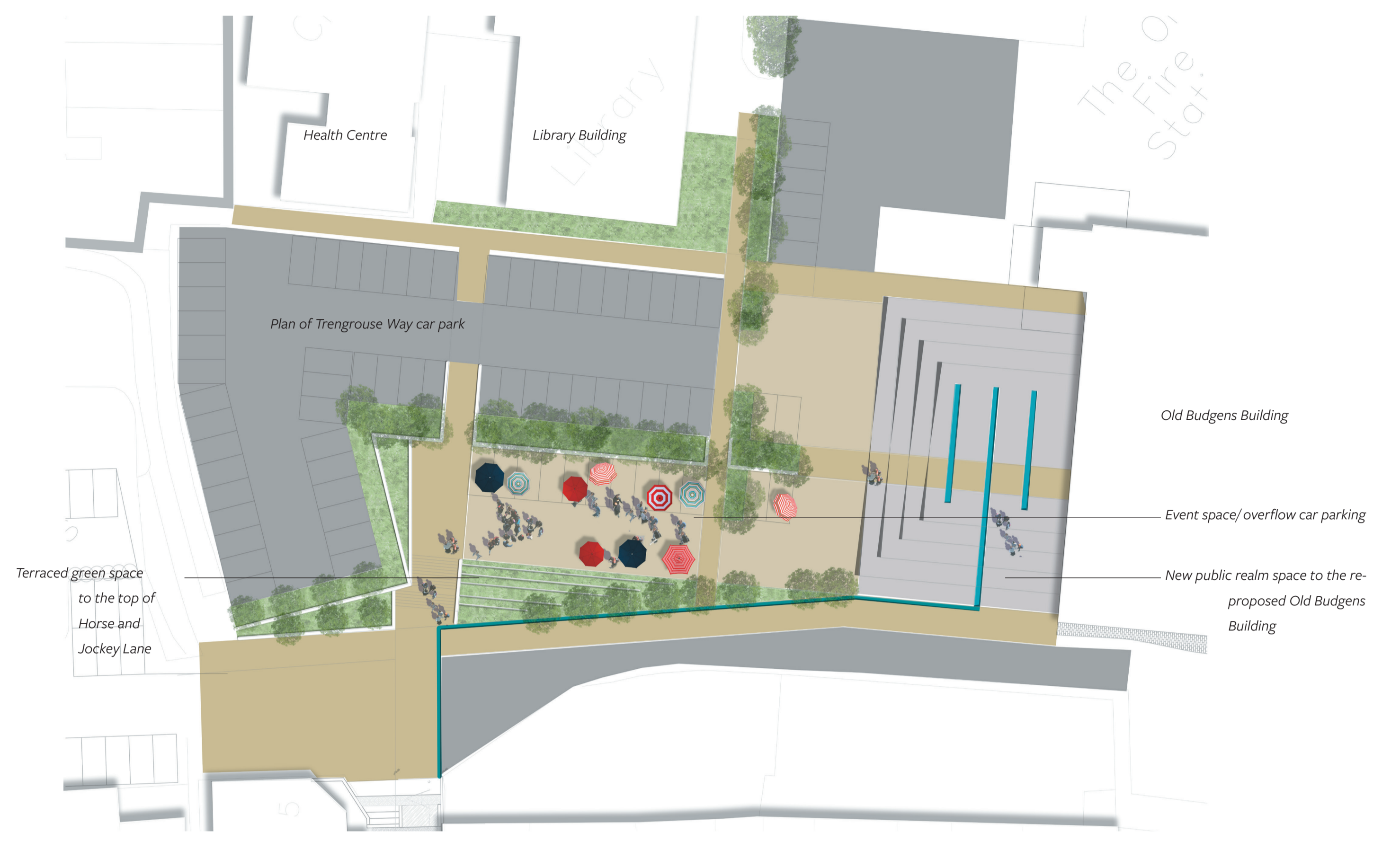
Plan of Trengrouse Way car park - proposals.