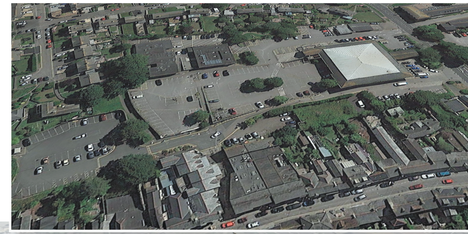
Aerial view of Trengrouse Car park- existing.

Repurposing parking lots into new green public spaces