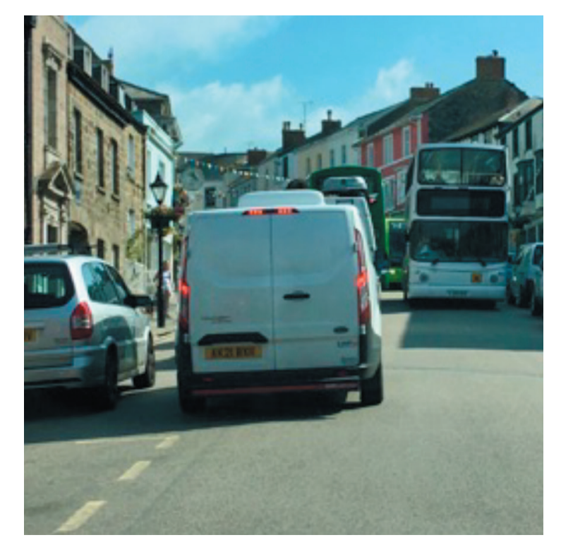
Existing traffic congestion in Coinagehall and Meneage Street

...promoting Active Travel & Sustainable Transport with improved cycling and public transport.