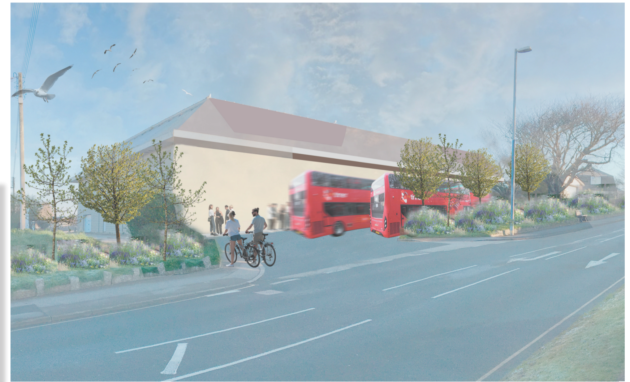
Artists impression of a proposed Sustainable Transport Hub on Trengrouse Way, at the old Budgens building.