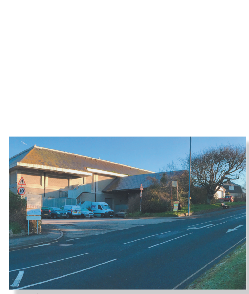
Location for a proposed Sustainable Transport Hub on Trengrouse Way, at the old Budgens building.

The aim of this project is to redress the imbalance between vehicles and pedestrians, making the town centre a more attractive and safe place for pedestrians, providing better connectivity for the community and its visitors.